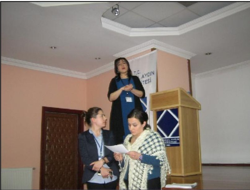
The Nitty Gritty of Peer Observation by Burcu Tezcan- Ünal