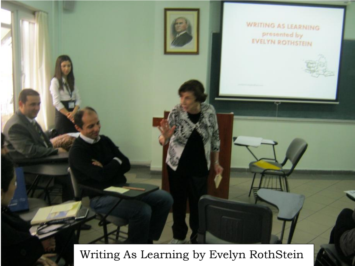
Writing As Learning by Evelyn Rothstein